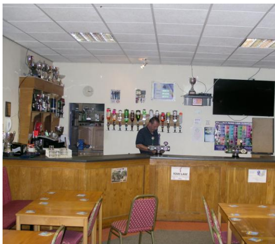
Tow Law Town FC Clubhouse

The Clubhouse continues to thrive, open every night, match days and Sunday lunchtimes