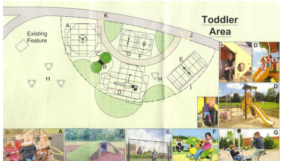
Plan of the new Playground