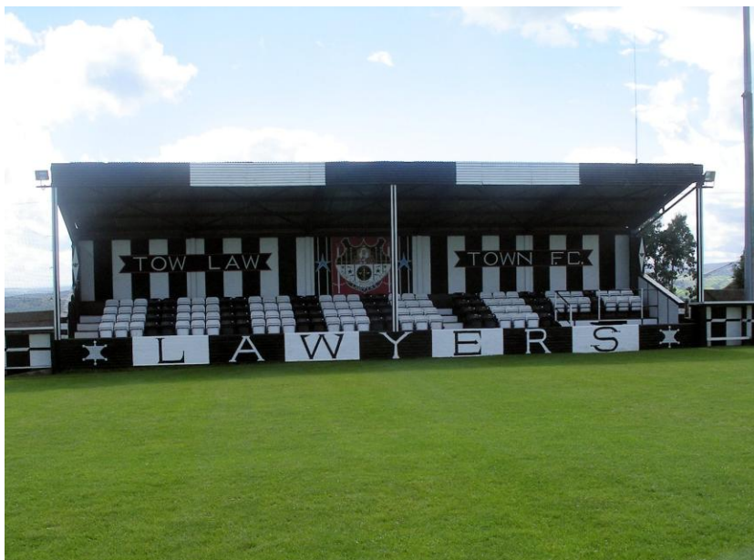
Tow Law Town FC Stand